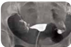
ABOVE LEFT: ULTRASOUND OF FOLLICLES IN THE RIGHT OVARY ABOVE RIGHT: X-RAY IMAGE OF A NORMAL HSG SHOWING UTERUS & BOTH FALLOPIAN TUBES

FERTILITY IMAGING is available at these Ascot Radiology branches: