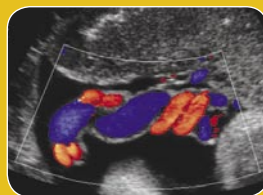
THREE VESSEL UMBILICAL CORD