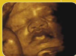
4D SCAN OF FACE AT 30 WEEKS

We would like you to enjoy your time with us. The radiologist and/or sonographer who performs your scan will be happy to help answer any queries you may have.