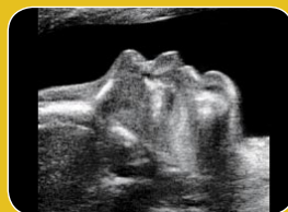
PROFILE OF FACE - 21 WEEKS